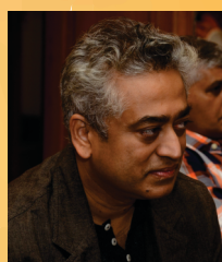
▲ TV Anchor Rajdeep Sardesai addressing the 8th Global Communication Conclave at Mumbai