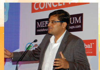
▲ Arnab Goswami at 6th Conclave, Mumbai.