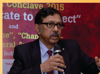
▲ Prasar Bharati Chairman addressing the 9th Global Communication Conclave at New Delhi